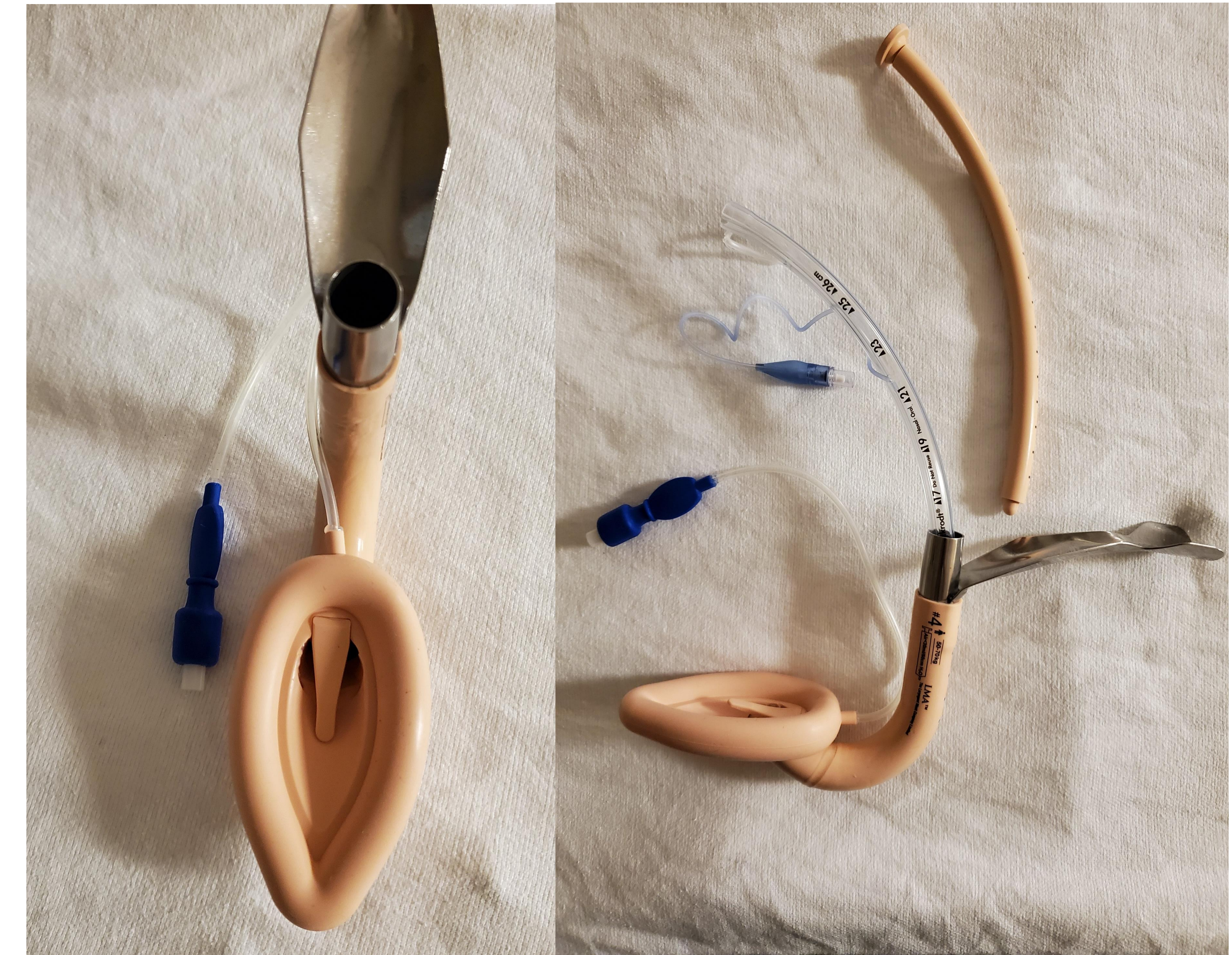
Figure 2: Left: Intubating LMA Right: Intubating LMA with stabilizing rod and endotracheal tube